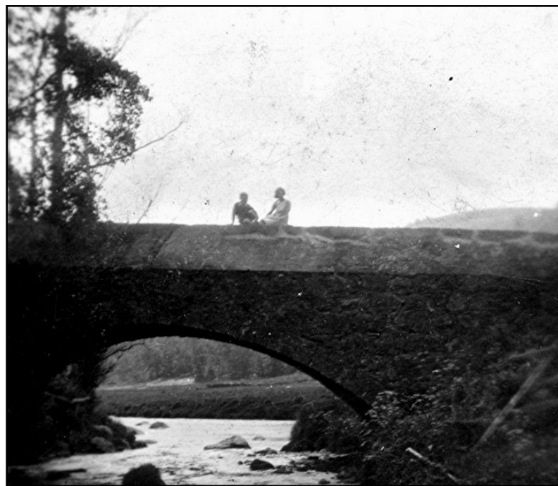
Bridge of Buchat c 1920