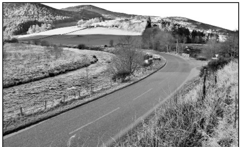
Bridge of Bucht 2015