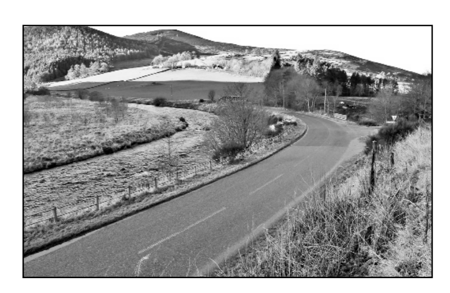
Bridge of Buchat 2015