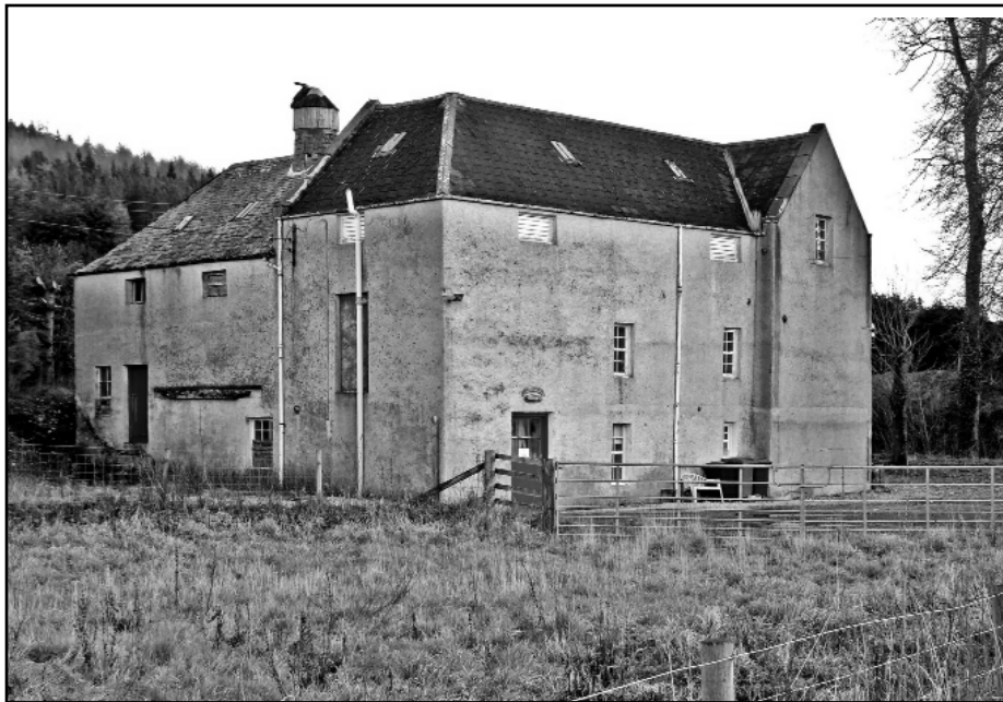
Mill of Newe